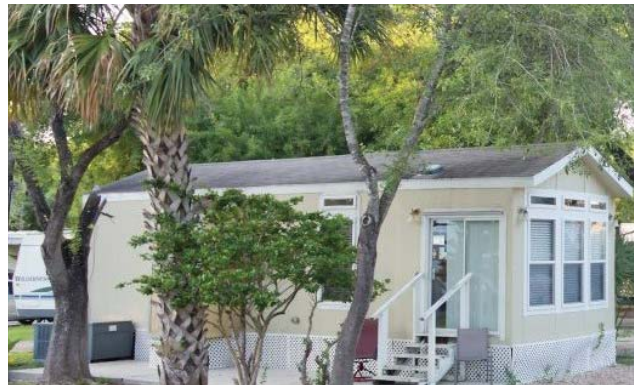
RV sites; or Park Model and RV rentals