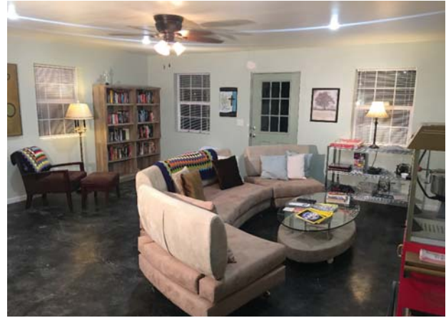
Recreation and Dining Hall